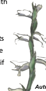
Autumn Ladies Tresses

Many of the special plants and animals living on the heath would not survive if it were not for such management.