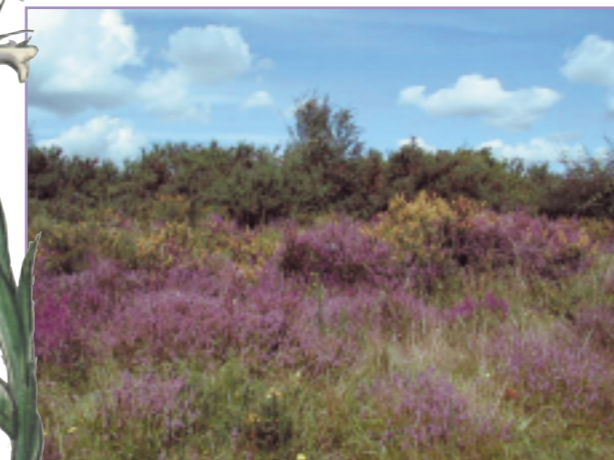
NOW, the Commons are full of life and here for everyone to enjoy