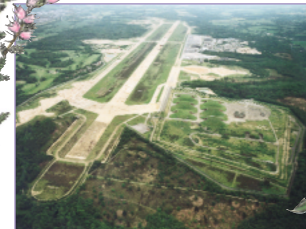
THEN, Greenham Common was once a strategic military site